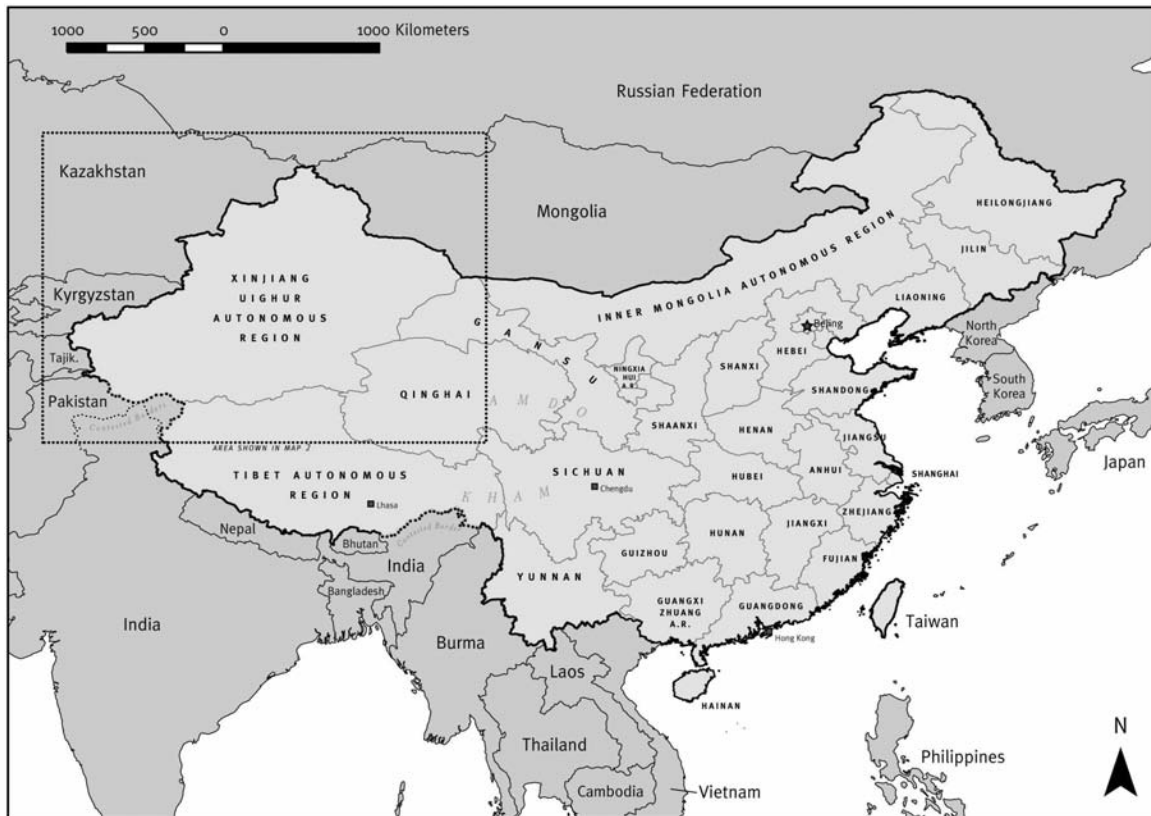
Map 1: Provinces and Autonomous Regions of the People's Republic of China