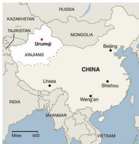
Source: Witness accounts

4 After 8 p.m. , rioters showed up in mixed neighborhoods around this area, where much of the violence occurred. Witnesses said bodies were strewn along Dawan North Road. Police didn't appear until after 1 a.m. , when the riot had ebbed and hundreds of men had been arrested.